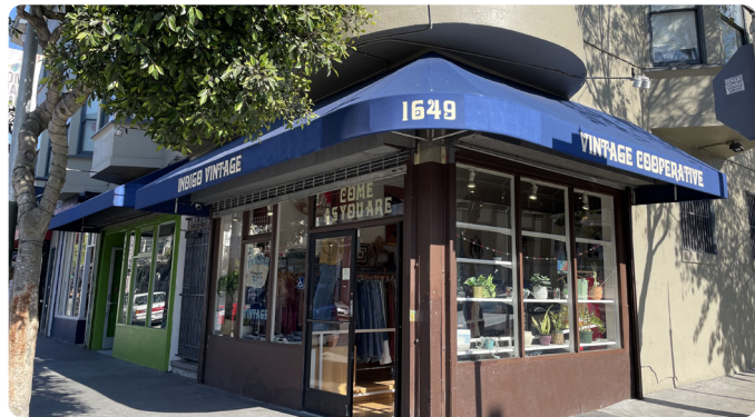
Standards as applied to a corner storefront.

Cannabis Retail uses and certain existing security gates that were installed prior to September 6, 2022, may be exempt from the above standards. Additional review may be required for certain historic buildings. Please contact the Planning Information Counter for more information.